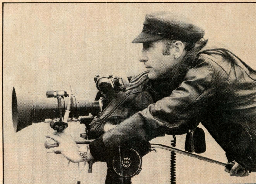
Almendros: A sensitive eye for nature. • Creando armonías visuales.

W hen Néstor Almendros picked up his well-deserved Oscar as best cinematographer for Days of Heaven , TV audiences all over the world heard him make his acceptance speech in Spanish. "I wanted to salute the 15 million Spanish speaking people in this country," he said, "to share the moment with them and let them know that one hasn't forgotten one's language